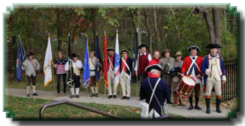
The Sons of The American Revolution at the Prospect Veterans Day Celebration

In other jurisdictions, the cameras have proven to be effective in fighting crime. They read license plate numbers and alert the police when a plate that has been stolen or that is on a stolen car is in the City. They perform the same function with regard to individuals with outstanding arrest warrants.